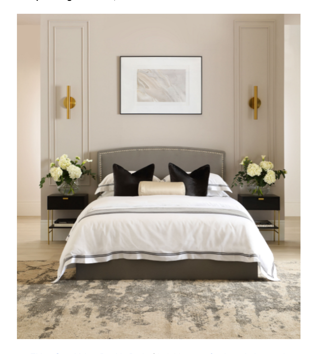
Eldon Grey Velvet Double Bed - £349.99 - www.furniturechoice.co.uk

A go-to interior design trick is to include luxurious textures in different ways and sections of the room. When paired with a monochrome background, this technique creates a curated, thoughtfully designed home.