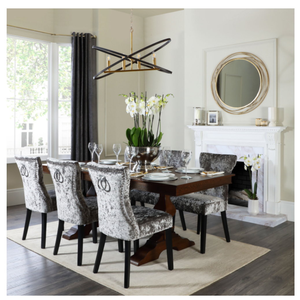
<u>Cavendish Walnut Extending Dining Table with 6 Kensington Silver Velvet Chairs</u> - £999.99 - <u>www.furniturechoice.co.uk</u>

Much as the right jewelry can complete an outfit, signature accessories can make a home feel unique, personal and expensive.