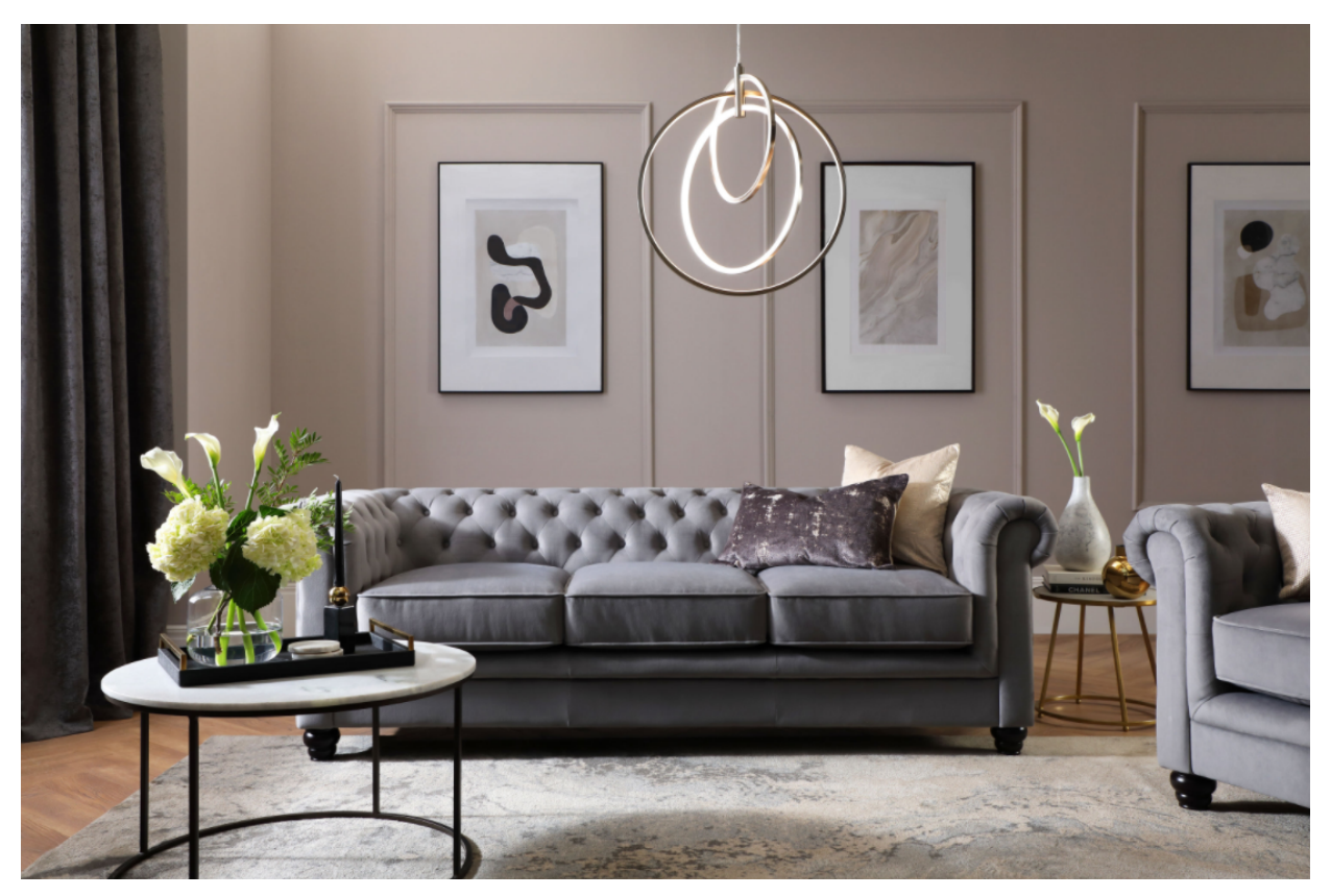
Hampton Grey Velvet 3 Seater Chesterfield Sofa - £799.99 - www.furniturechoice.co.uk

A classic monochrome colour palette has an effortlessly elegant quality, with tonal neutrals such as grey and taupe providing a calm, sophisticated feel. The key is to ensure contrast and variety with these tones, creating visual interest and movement.