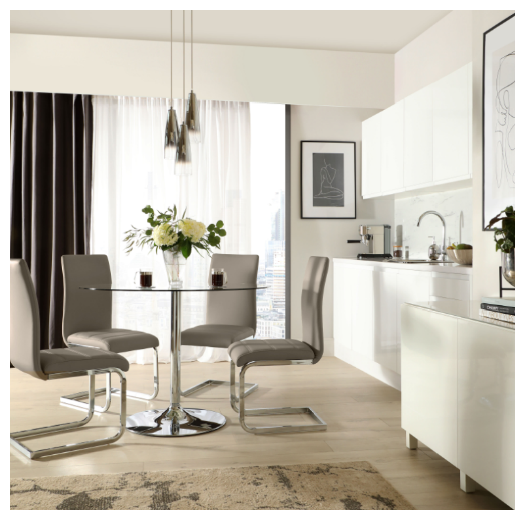
<u>Plaza Round Chrome and Glass Dining Table with 4 Perth Grey Velvet Chairs</u> - £449.99 - <u>www.furniturechoice.co.uk</u>

Statement lighting is a simple change that will immediately give the home a designer sheen. Lighting the home well will highlight all the details and thought that has gone into it, while adding a stylish touch.