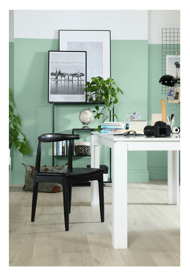
Aspen Table - £349.99 - www.furniturechoice.co.uk

Seen on designer runways, green and its invigorating qualities have made its way into our homes. "Green reminds us of nature and is both inspiring and relaxing," says Rebecca. "It's perfect in rooms like the home office, where it helps to freshen up the space and promote focus, calm and productivity." Paint the walls in creamy white and Pantone 14-6011 Grayed Jade for a bright and airy feel. Keep the overall scheme pared back, like pairing a simple white desk with a black chair. Work in black accents like wall frames and minimalist shelves for a smart, stylish look.