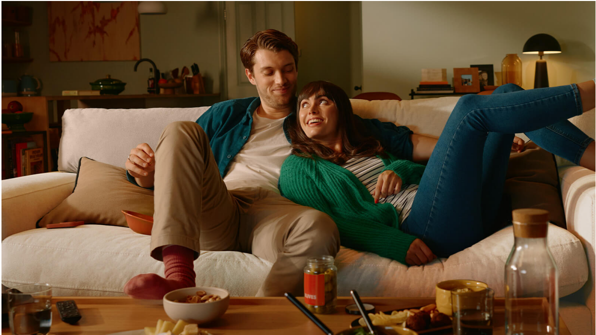
Furniture And Choice - Keep on Living Campaign - Download images

Online retailer Furniture And Choice teams up with McCann Manchester for its first TV ad campaign.