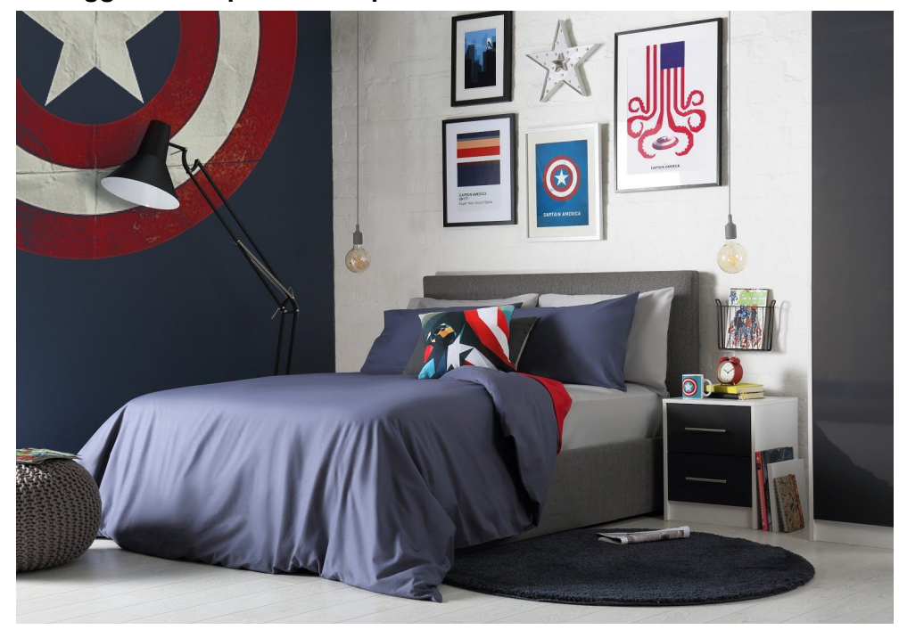
<u>Kaydian Hexham Elephant Grey Fabric Storage Bed</u> - £398, <u>Bloomsbury White Grey & Gloss Bedside Cabinet</u> - £59.99 —www.furniturechoice.co.uk