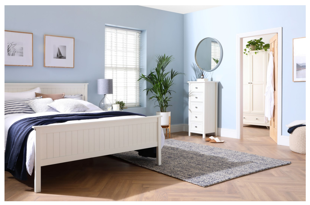
Dorset White Wooden Double Bed - £299.99 - www.furniturechoice.co.uk

Choosing the right colours for the home has always mattered, especially since colour can have a significant impact on mood and emotions. For a quiet, relaxing space, shades with a tranquil, natural quality, such as blue and green are ideal choices.