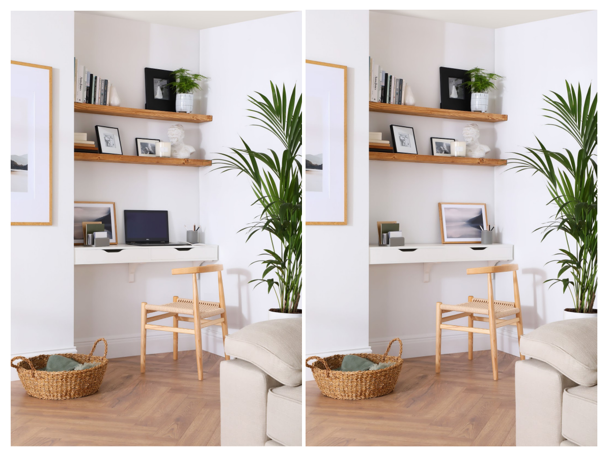
Furniture And Choice

Traditionally, the home has been a space to unwind from the office - and all the tasks associated with it - but recently, those boundaries have blurred.