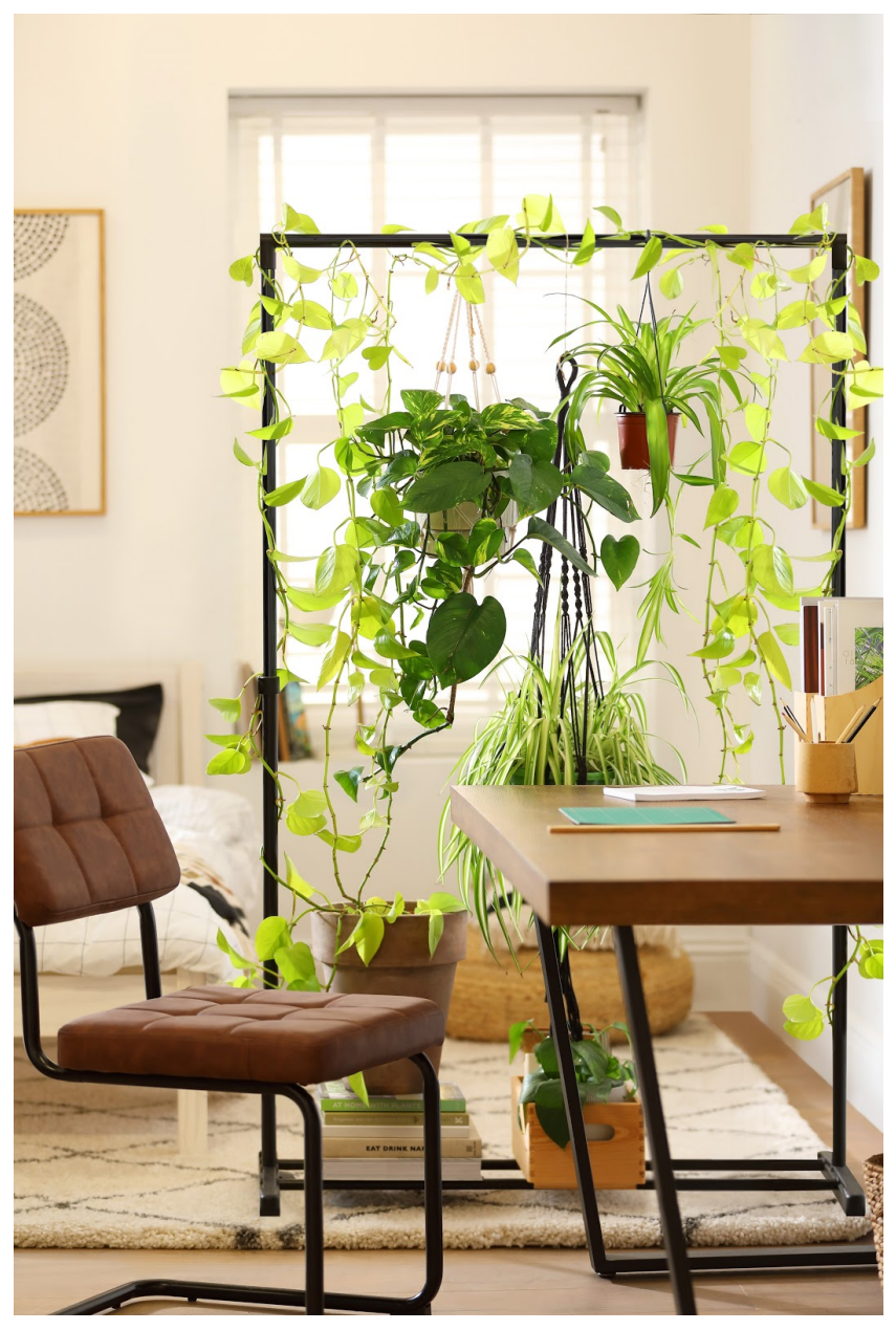
<u>Carter Tan Leather Dining Chair</u> - £59.99, <u>Addison Industrial Oak 150cm Dining Table</u> - £299.99 - <u>www.furniturechoice.co.uk</u>

Making strategic use of elements such as rugs, plants and paint can also go a long way when it comes to zoning the home and setting different moods.