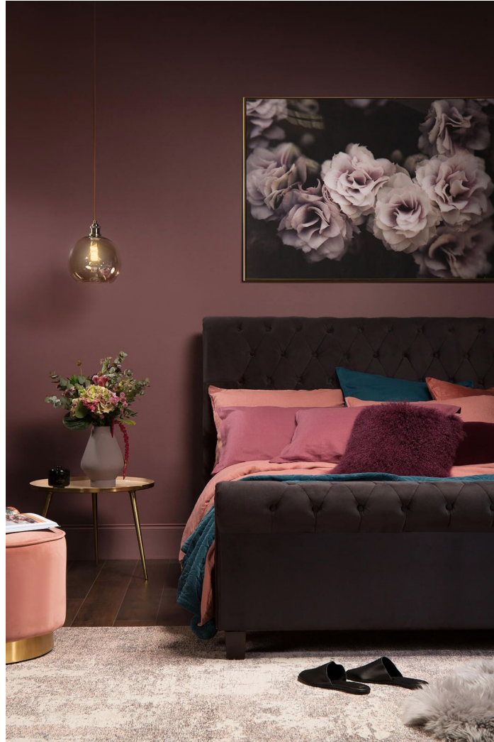
Orbit Black Velvet Double Bed - £379.99 - www.furniturechoice.co.uk

This autumn, let rich jewel tones like deep mauve, sapphire blue and dusty pink take centre stage. “Embrace the sophistication of the season in all its moody glamour,” says Rebecca.