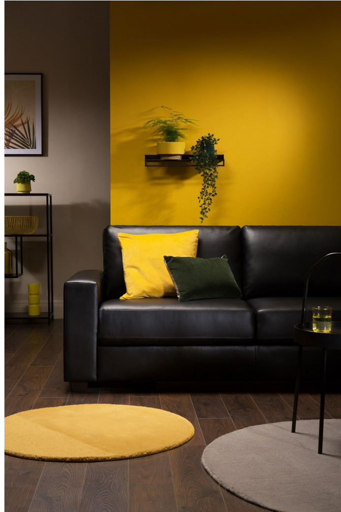
Mission Black Leather 2 Seater Sofa - £399.99 - www.furniturechoice.co.uk

On a brighter note, pairing black and yellow results in a lighter, modern take on autumn decor. One part dark, one part festive, and altogether stylish - choose a dark yellow like mustard, in homage to autumn’s signature leaves. “This trendy colour contrasts nicely with a sleek black leather sofa to produce an edgy and season appropriate palette,” says Rebecca. Go bold with a mustard feature wall or start small with yellow cushions, rugs and planters.