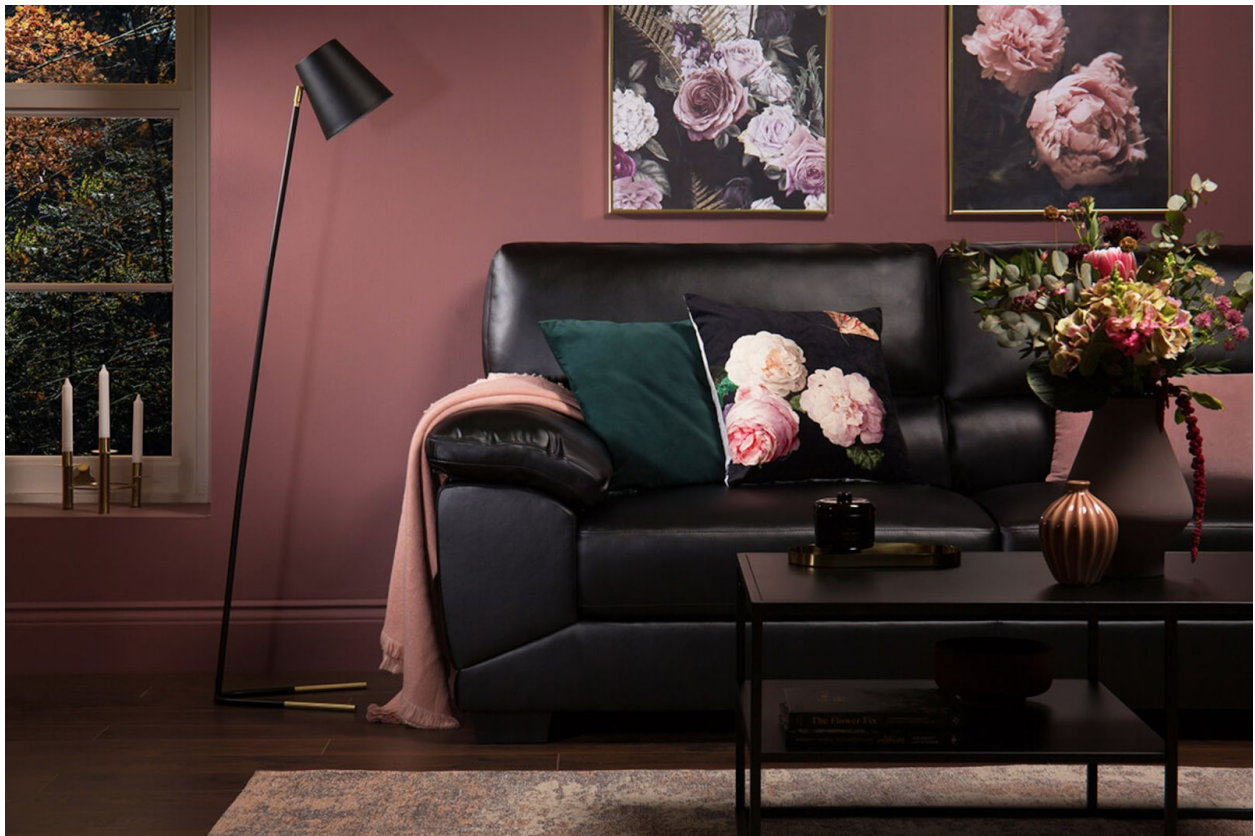
Oregon Black Leather 2 Seater Sofa - £399.99 - www.furniturechoice.co.uk

Rebecca Snowden, Interior Style Advisor at Furniture Choice , shares 3 decor tips to style a cosy home for Autumn 2019.