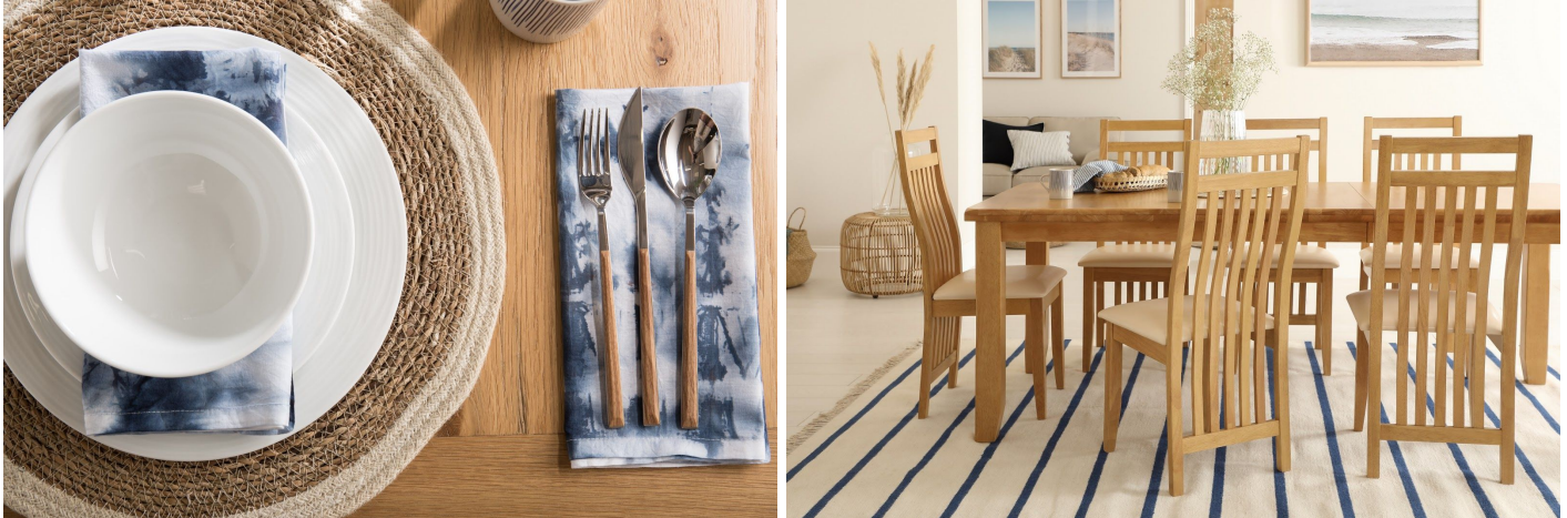
Highbury Oak Extending Dining Table with 4 Bali Chairs -£549.99 - www.furniturechoice.co.uk

Help reduce any dye bleeds by rinsing the napkins with cold water until the water runs clear. When that is done, remove the rubber bands and rinse with warm water. This is the time to admire your handiwork!