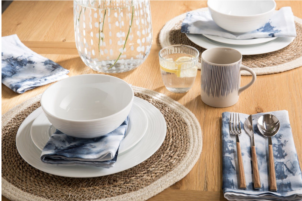
Highbury Oak Extending Dining Table - £399.99 - www.furniturechoice.co.uk

Visit our website for the full DIY article