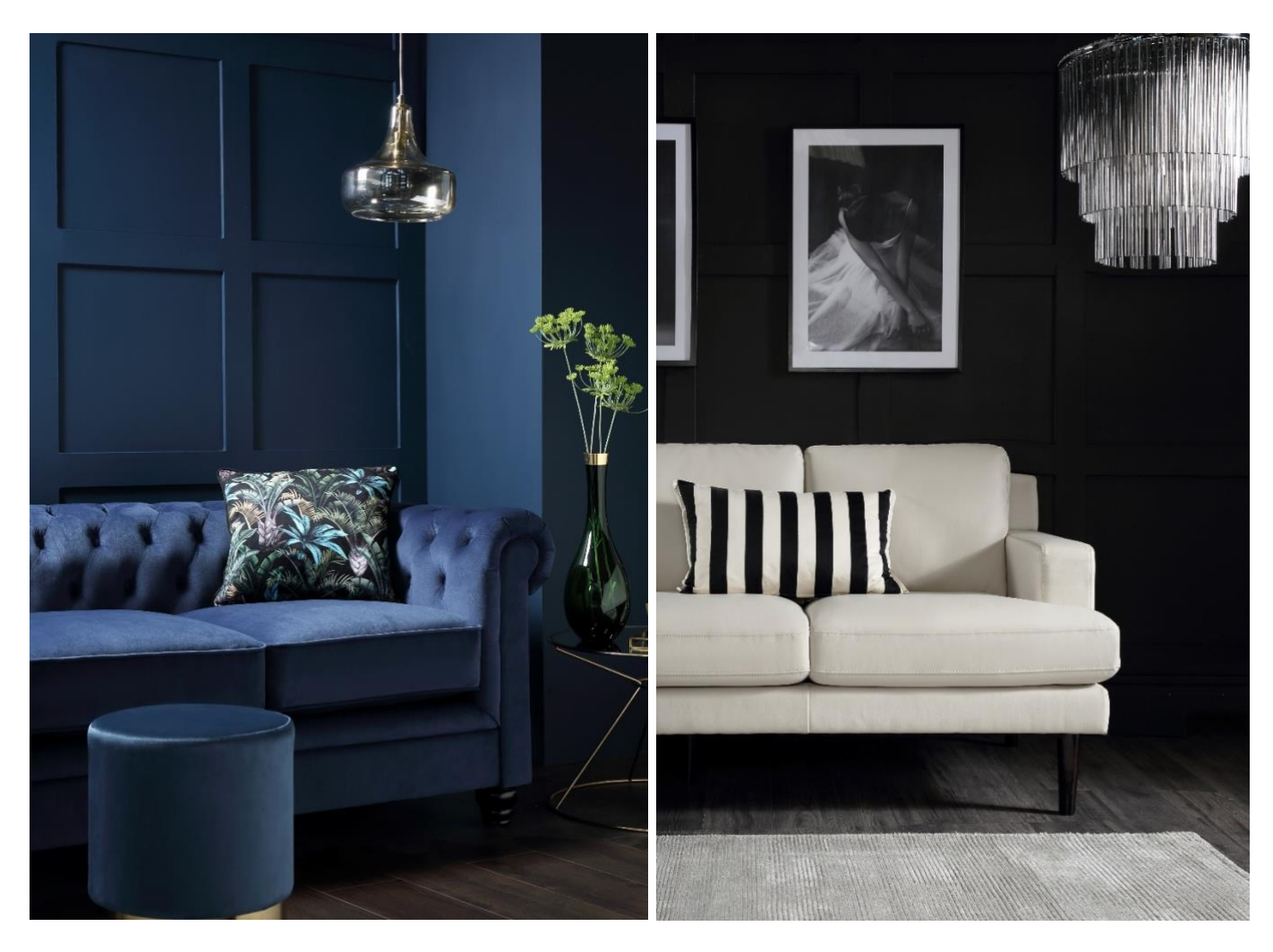
Hampton Blue Velvet Sofa - £599.99

For a fully amped up look, accentuating the space with accessories such as elegant lighting and artwork will also bring a chic, modern approach to Art Deco.