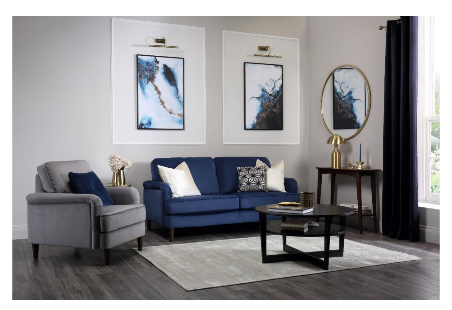
Pembroke Velvet Sofa Range - from £399.99 -www.furniturechoice.co.uk

Rebecca Snowden, Interior Style Advisor at Furniture Choice shares 4 ways to embrace a modern Art Deco-inspired look at home.