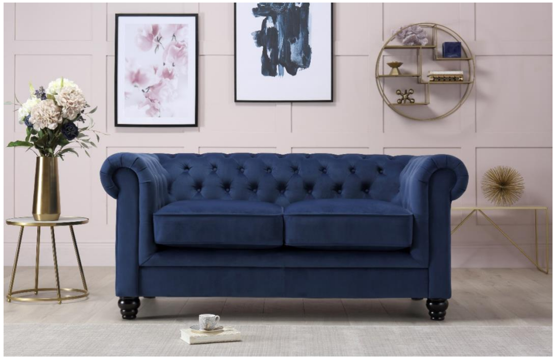
Hampton Velvet Sofa Range - £599.99 - www.furniturechoice.co.uk