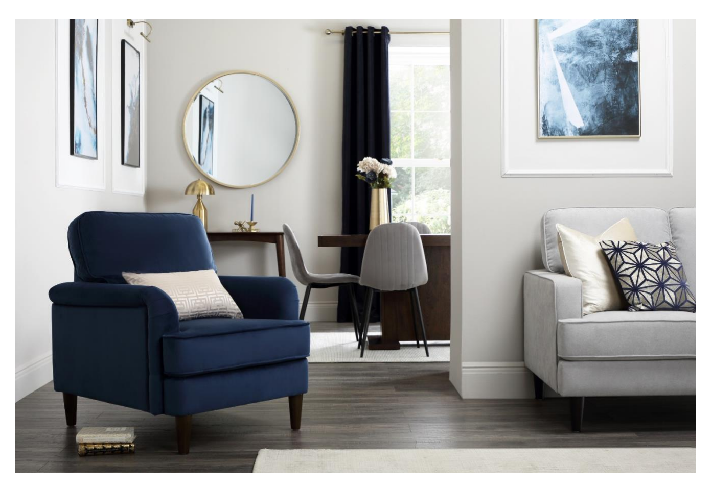
Albion Sofa Range - from £399.99 - www.furniturechoice.co.uk

"Marble is another finish that offers a bold, edgy vibe. Elements like framed art and cushions are easy ways to showcase marble around the home. This statement texture can be matched with soft neutral furniture, or layered up with rich, jewel shades for a dramatic look."