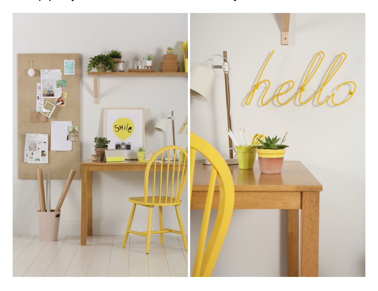
Milton Dining Table Light 120cm - £149.99- www.furniturechoice.co.uk

For a more subtle approach that doesn't entail painting the walls, look at incorporating pops of sunny yellow in other parts of the home such as the home office. As a colour that inspires creativity and represents optimism, the addition of yellow to the study may just help get the creative juices flowing.