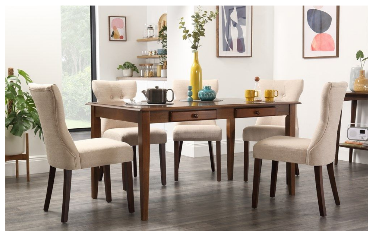
<u>Wiltshire Dark Wood Dining Table with 4 Bewley Oatmeal Chairs</u> - £549.99 - www.furniturechoice.co.uk

Yellow also works beautifully in the dining room, lending warmth and cheer to the heart of the home. Pick a deep yellow shade like mustard, honey or butterscotch; these darker yellow accents are set to be a major colour trend for Autumn 2019 and bring a fresh, vibrant twist to neutral palettes.