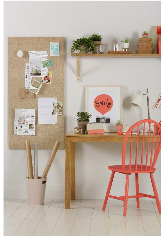
Milton Oak Table - £139.99 – www.furniturechoice.co.uk

"For a boost of productivity and colour, pop Living Coral into the home office. A coral chair instantly revitalizes the space with its warm, golden undertones – it also makes for a fun, inexpensive DIY project."