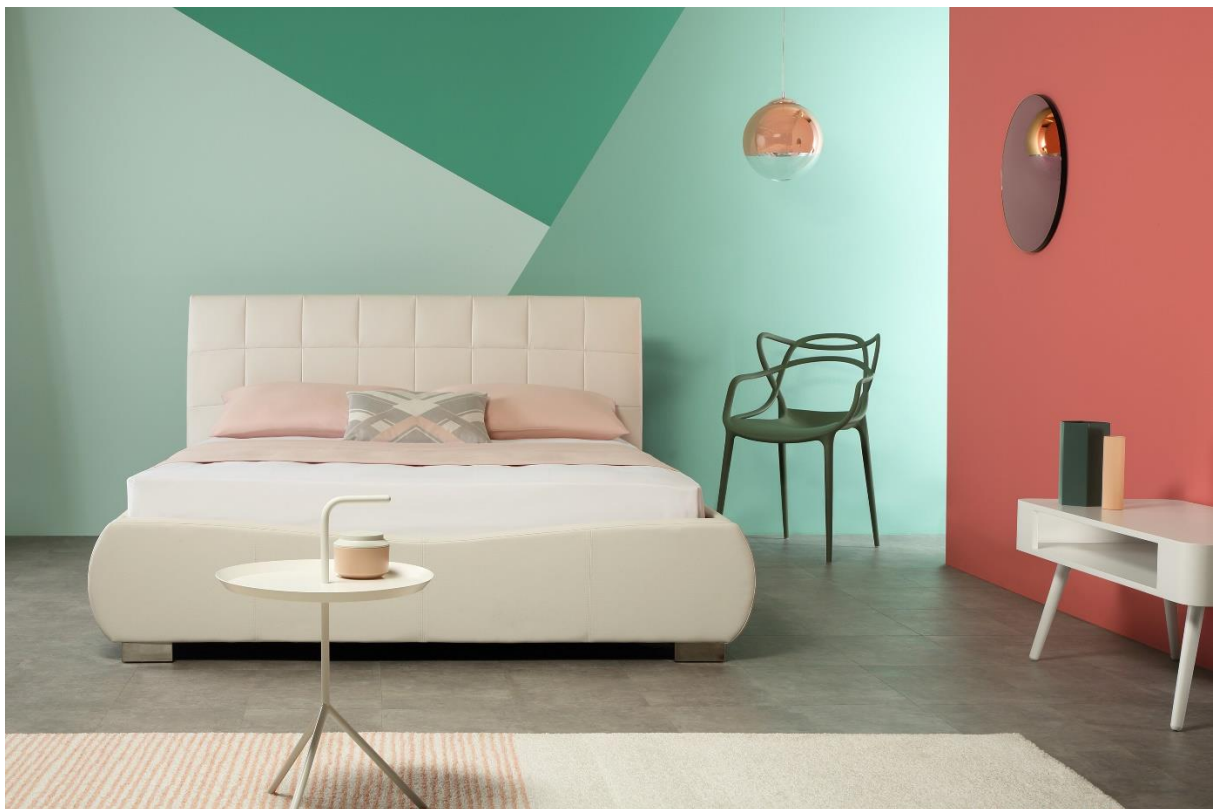
Dorado White Leather Bed - £319.99 – www.furniturechoice.co.uk

Colour blocking is another chic way to introduce Living Coral to the home. Often seen as a Spring/Summer trend, matching this warm shade with other colours creates a striking contrast - a great way to tackle the winter blues.