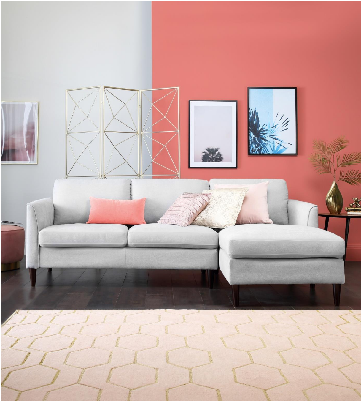
Hayward Dove Grey Corner Sofa - £699.99 – www.furniturechoice.co.uk (Launch Date December 2018)

“The best approach to play with this colour block trend is by taking it to the walls,” Rebecca says. “Living Coral can be paired with unexpected shades like mint for a fresh and on-trend aesthetic, or greys and blush tones for a softer statement look. This adds a natural, welcoming feel to a space while also showcasing the vivid, chromatic qualities of this dazzling, joyful colour.”